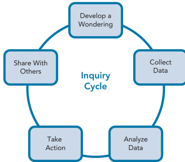
Figure 1.1 Inquiry Cycle